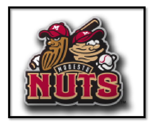
Night out at The Modesto Nuts with UCP Friday June 15<sup>th</sup> @ 5:30 must RSVP by May 30th